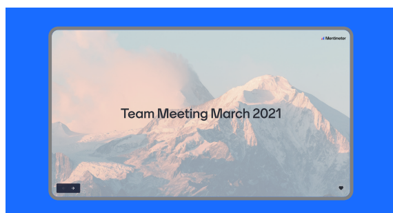
Weekly Team Meeting

Don't forget on an Enterprise account you can add your company logo and brand to the presentation to ensure brand consistency and create polished slide decks. All of these presentations can be used for remote teams or in face-to-face sessions.